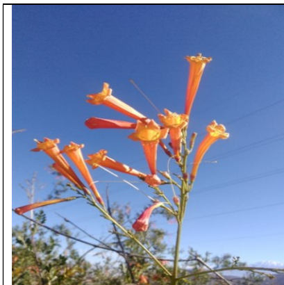
Fig. 1. Taxonomic classification of tecoma fulva sub sp arequipensis (T).

The material used in the research was collected in the month of December from native ornamental mother plants of Yarabamba and Chiguata districts of Arequipa. The Yarabamba district and Chiguata District are located at 21.2Km and 23.4Km respectively from Arequipa city. The selected native flora species were: Tecoma fulva sub sp arequipensis , Mutisia acuminata , Calceolaria pisacomensis meyen , and Balbisia verticillata cav , and in the Fig. 1, Fig. 2, Fig. 3 and Fig. 4 are showing their taxonomic classification. In this research work, vegetative materials were collected, taking a sample size close to the basal middle third of native flora species. For material collection were used pruning scissors, water with bleach at 5%, paper bags, ziploc bags, water, and GPS. A mixture of sand, pumice stone, and compost was used as a substrate. Propagation beds with a mist irrigation system (Propagation beds are rectangular-shaped cement structures), identification cards, and 75% black raschel mesh were used for rooting of stem cuttings. Different concentrations of Rapid Root (RR) and Root Hort (RT) as growth regulators were used.