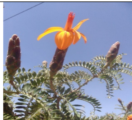
Fig. 2. Taxonomic classification of mutisia acuminata (M).

Kingdom: Plantae, Subkingdom: Tracheobionta, División: Magnoliophyta, Clase: Magnoliopsida, Orden: Lamiales, Family: Bignoniaceae, Tribu: Tecomeae, Genus: Tecoma.