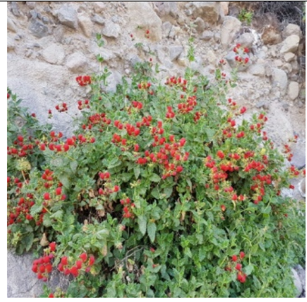
Fig. 4. Taxonomic classification of calceolaria pisacomensis (C).

Kingdom: plantae, Division: tracheofita, Class: magnoliopsida, Order: geraniales, Family: vivianiaceae, Gender: balbisia