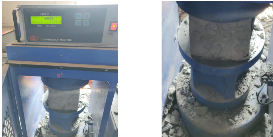
Figure 2: Compressive test on concrete

For the testing purpose, four samples have prepared with different combinations of Zeolite replacement. Replacement percentage is 0, 10, 20 and 30% of weight of cement. Concrete Testing machine is used to test the samples of size 15cm x 15cm x 15cm.