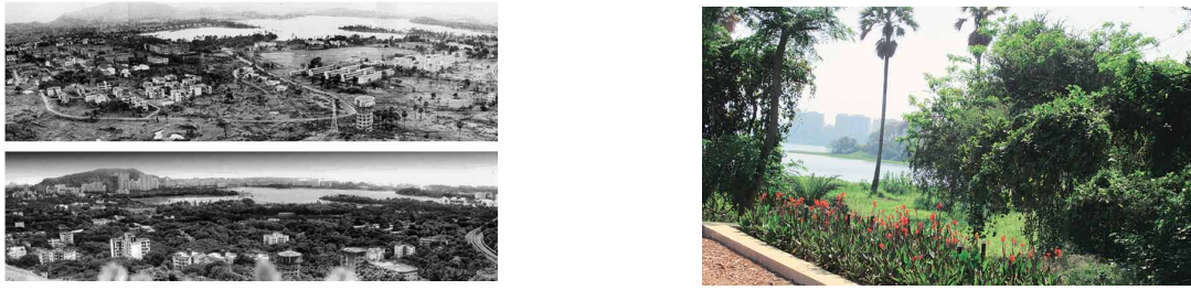
Fig1(a)Aerial photo pf IIT campus in 1972 [top] and 2003 [bottom](b) Pilot wetland project near Powai lake [2]

The second case study is the Biodiversity Training Institute in Sikkim. The state of Sikkim is one of the world’s ten most critical centres for biodiversity according to world wild fund and lies in the eastern Himalayas which is recognised as a mega-diversity centres of the planet. The continued pristine condition of the ecosystems, conservation ethos of the ethnic groups and sustainable development initiatives of a pro-environment government has resulted in the development of a training institute to impart the knowledge of preserving the mountain culture to the younger generations.[5] The design of this institute was realised jointly by Indian and international architecture firms, locals and state government experts. The resultant concept handles sustainability through its uniquely designed façade and sensitive planning in its effort to become a home for surrounding flora and fauna [6]. It becomes a link in not just the transfer of knowledge from the tribal groups to the urban population but also in giving a platform to the ethnic groups to display their skill, traditions and gain financial stability.