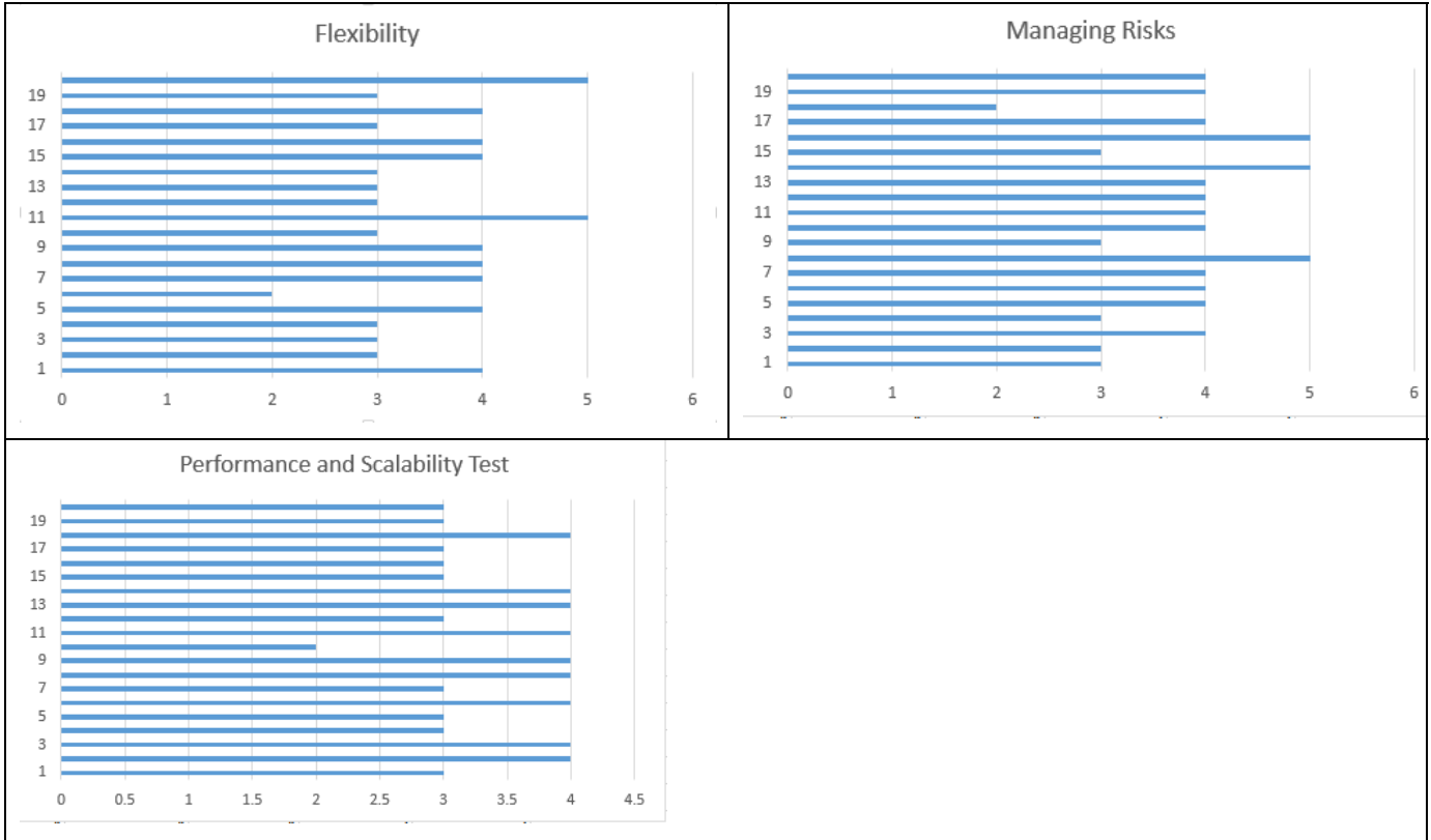
Figure 2. Ratings on different skills